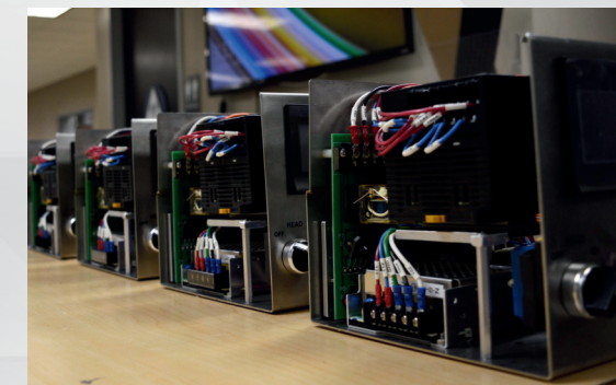
CUSTOM BUILDS AND ASSEMBLIES