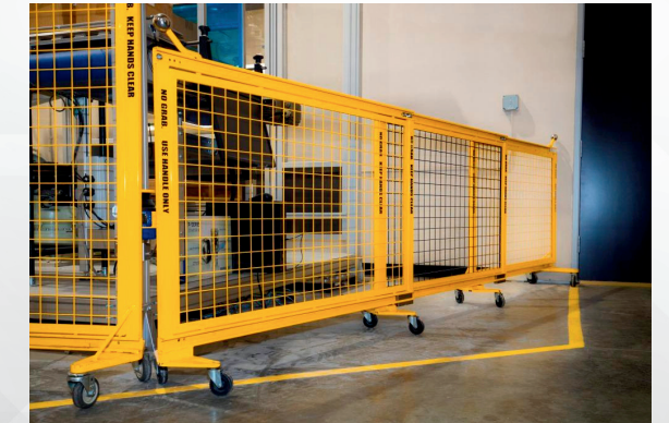
SAFETY FENCING AND BARRIERS