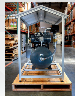
ALUMINUM EXTRUSION BUILDS