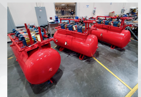
CUSTOM PAINTING AND COATING

Brenner-Fiedler is recognized as a service leader, driving innovation, and propelling the future of manufacturing.